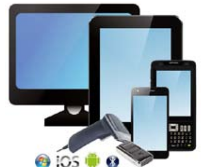
iPad and iPhone are trademarks of Apple.

EPIC Track is Easy. It's software is intuitive, requiring minimal training and smooth implementation throughout any organization. With EPIC Track, there are no servers to configure, it has a simple user interface, and contains prebuilt reports. It's basic design makes EPIC Track the perfect tool for any number of tracking scenarios, making it a cost effective and value added solution. EPIC Track can easily be integrated with mobile devices such as smart phones, handhelds, tablet PCs, and desktop PCs supported by Apple, Android and Windows operating systems. This out of the box tracking solution makes deployment simple, fast and successful every time.